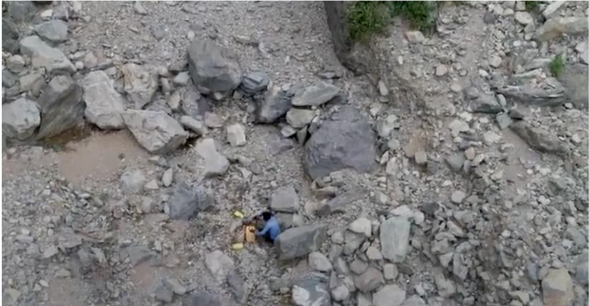
Finally Abdella gets to the water